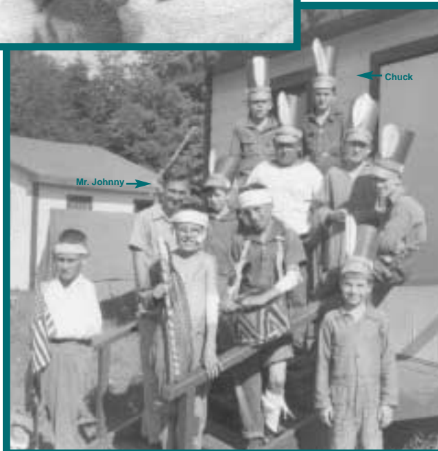
1948 Raccoon Cabin in costume for the 4th of July